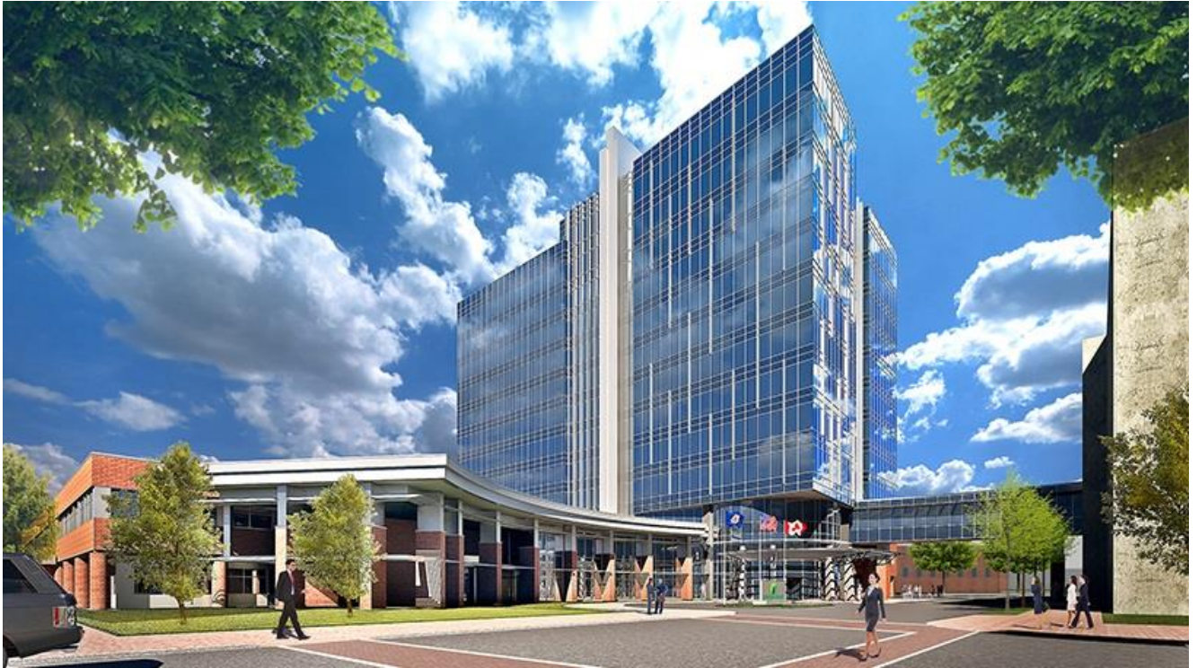
Dollar Tree World Headquarters at Summit Pointe