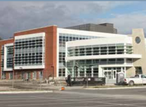
In 2013, Tidewater Community College opened its new 60,000-square-foot academic building and launched a workforce development program.

"This state of the art building features 21 general purpose classrooms fully equipped with modern technological devices, a multi-purpose assembly space and the Learning Assistance Center and English lab. Like all our new TCC buildings, the CAB [Chesapeake Academic Building] is expected to achieve the Leadership in Energy and Environmental Design Silver certification, due to its energy-conscious design and environmentally-friendly building materials. All of these features add up to a facility in which TCC, as well as the City of Chesapeake, can take enormous pride."