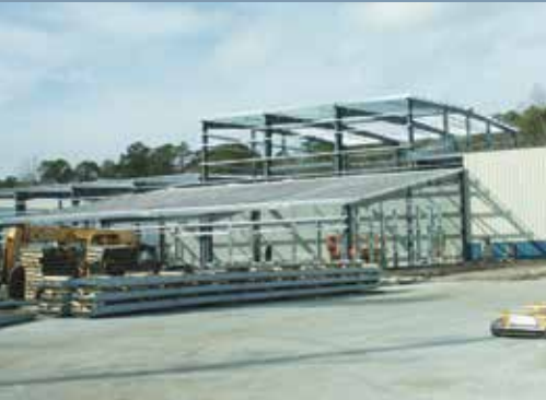
Atomized Products Group Inc. invested $4.3 million to establish a manufacturing and distribution operation in Chesapeake, creating 26 new jobs.