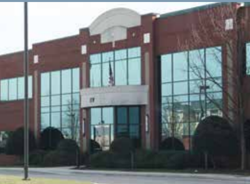
Sutherland Global Services, DB Schenker and Gannett have all leased office space in Liberty Executive Park, totaling more than 88,000 square feet.

"All three companies were attracted to Chesapeake's prime location and dynamic workforce. Sutherland's move allowed the company to triple its office space and expand its growing team. Gannett and DB Schenker were also drawn to local amenities the area has to offer, such as restaurants located in Towne Place at Greenbrier."