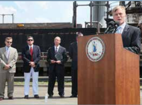
Perdue AgriBusiness Inc. signs an export agreement to supply eight million bushels of its soybean crop to China's Jiusan Oil and Grain Industries Group.

"Perdue AgriBusiness appreciates the work of Chesapeake Economic Development as we continue to expand the market for Virginia soybeans. New markets and new customers allow us to efficiently utilize our deep port assets in Chesapeake, which in turn creates jobs and economic activity for the many other businesses that support us."